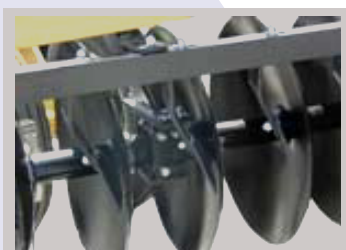
1 ½" triple sealed bearing in cast trunnion mount housing