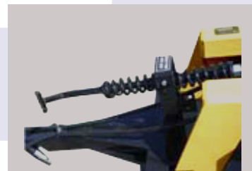
Self-leveling, spring cushioned hitch with hand crank